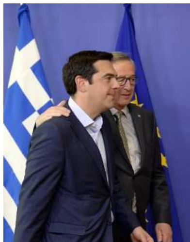
Tsipras, left, with European Commission president Jean-Claude Juncker on Wednesday